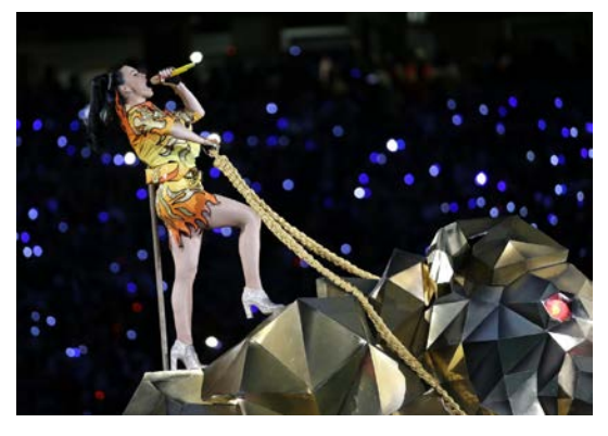
Katy Perry - "Hear me Roar" Super Bowl 2015