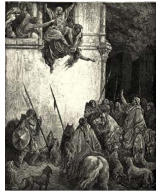
2 Kings 9:33 "Throw her down."

"I can see that the enemy attacks the godly virtues of women to supplant with the spirit of Jezebel" – workshop participant