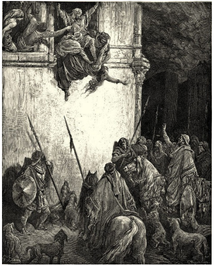
2 Kings 9:33 "Throw her down."